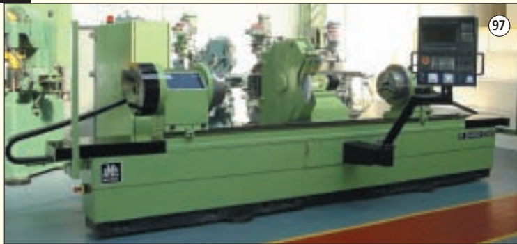
AMC SCHOU: Type R2400 CNC Cylindrical Grinder. New 1999. Siemens Sinumeric 840D 1810 D. 700mm Diameter Swing. 2400mm Distance Between Centres. Max Capacity 900 Kg. £65,000