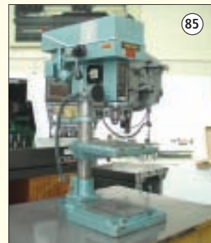
MEDDINGS Type MB4: Bench Drill No.2 Morse Taper. Speeds 80-4000 rpm. with Back Gear. Single Phase £750