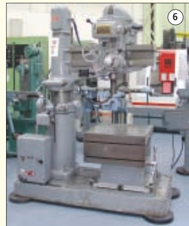
ADCOCK & SHPLEY: 36" Radial Arm Drill. 3 Morse Taper (1"). Power Rise & Fall to Column. 24" x 24" Tilting Box Table. Ex. College. £2,950