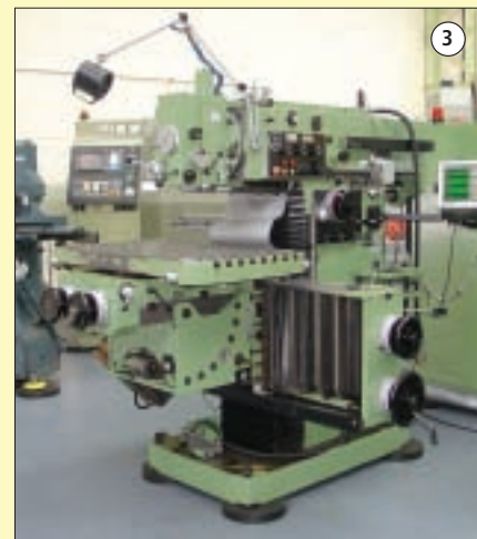
MAHO Type MH800: Precision Toolroom Universal Mill. Table Size 1050x 600mm. Longitudinal Travis 700mm. 40 iso. 3 Axis DRO. Tooling £9,950

PLEASE OFFER US ANY SURPLUS MACHINERY YOU HAVE FOR SALE