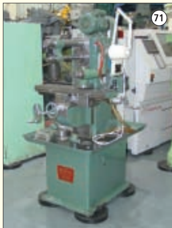
TOM SENIOR: Horizontal Miller Table Size 28" x 6 1/2". (Single Phase) with Vertical Head.