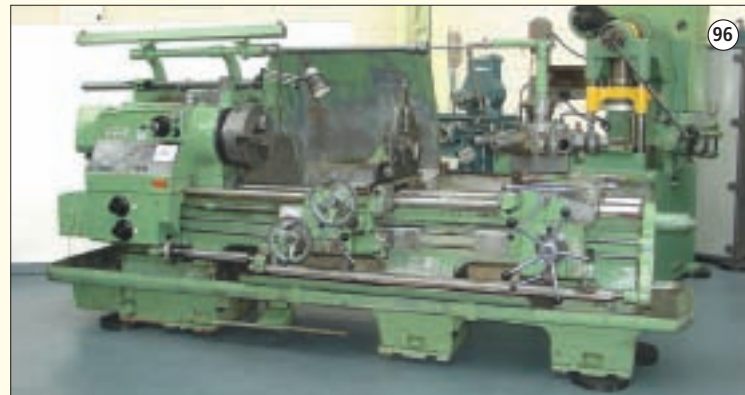
WARD 7E PRELECTOR: Raised Centre Combination Turret Lathe. Spindle Bore 5 1/4". Swing over Bed 22" Swing over crossslide 16". With 15" 3 Jaw Chuck and 3 Point Steady.