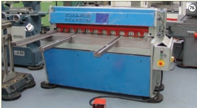
EDWARDS PEARSON Model 3.5/1270 DD: Power Guillotine. Capacity 1270mm x 3.5mm (Imp 55" x 1/8"). 7.5 hp Motor. With Back Gauge & Safety Guard.