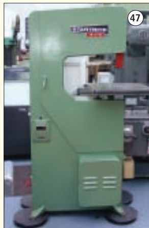
STARTRITE Type 18-S-10: Vertical Bandsaw. 19" x 19" Table. 18" Throat. 10" Daylight.