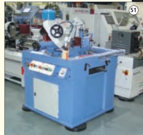
(NEW) UMS Type Westcut 220 DG: Semi Auto. Double Mitre Cut Off Bandsaw. Cap 220mm Rounds. SUPER QUALITY.