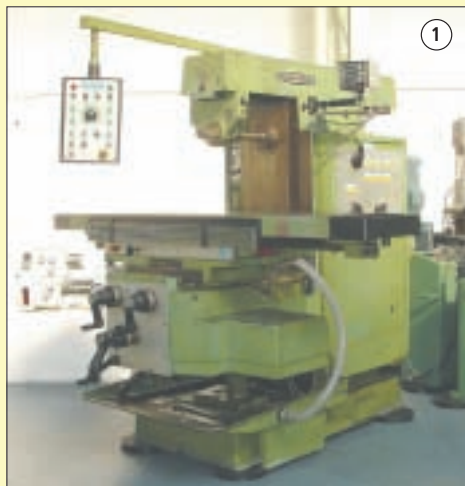
PARKSON M 1700 SERIES: Heavy Duty Horizontal Mill, with Auto Cycle to Table & Knee. 75" x 17½" Table. Approx 48" Long Traverse. Speeds 27 to 1600 rpm with 3 Axis D.R.O. £9,950