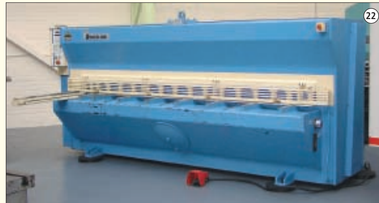
KINGSLAND Type KTSX 3006 MOT: Hydraulic Guillotine. Capacity 3050mm x 6mm. Complete with SC7 Programmable Back Gauge. Year 1998. (Ex. M.O.D.)