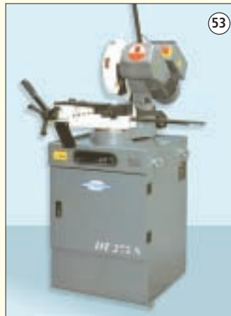
(NEW) WESTCUT TEKNIK DT 275 S: Cut Off Saw. Capacity Tube Round 85mm. Square 75mm. Rectangular 95x60mm. £1,375