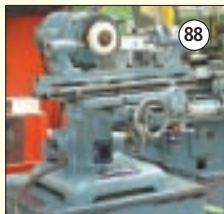
UNION: Tool & Cutter Grinder. £950