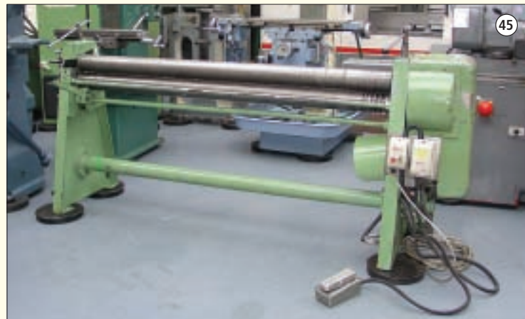
F.J. EDWARDS: Initial Pinch Power Bending Rolls. Cap. 72" Length. 4" Dia Roll. Top Slip. Quick Release. Upto 3/4" Bar Bending Cap.