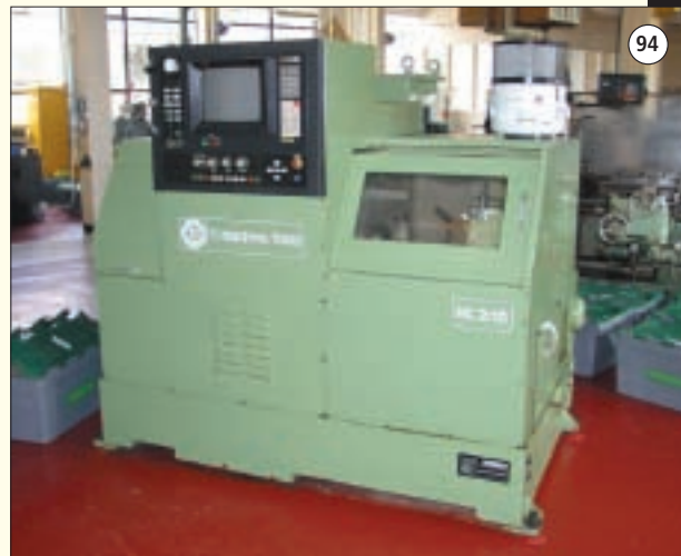
T I MATRIX: HC 2/10 CNC Centre Lathe. Fanuc 10T Control. Ex MOD. Little Used.