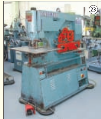
KINGSLAND 55XS: Hydraulic Steel Worker. Punching 32mm x 13mm. Shearing 375mm x 10. With approx 25 Punches & Dies. £3,950