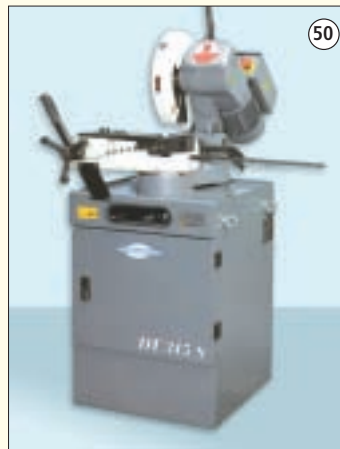
(NEW) WESTCUT TEKNIK DT 315 S: Cut Off Saw .Capacity Tube Round 105mm. Square 85mm. Rectangular 120x70mm. £1,675