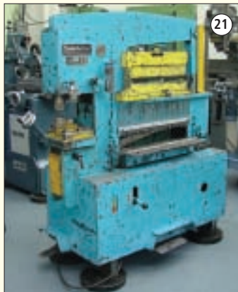
SCOTCHMAN Model 5075: Hydraulic Iron Worker. Cap. 50 Ton. Angle 4"x 4". Square 1". Round 1". Fold & Crop upto 24" Wide. £1,750