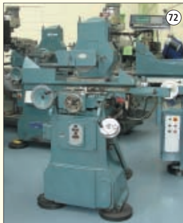
JONES & SHIPMAN 540: Surface Grinder. 18" x 6" Capacity. Metric Dials. Mag Chuck & Cross Axis DRO.