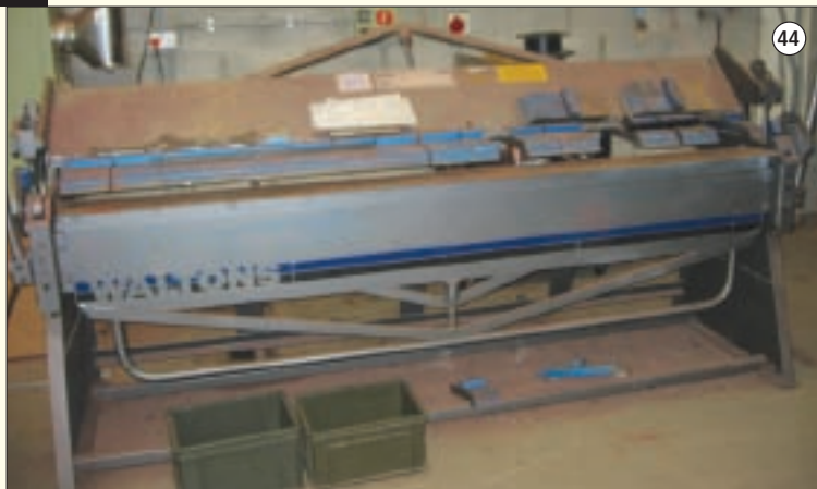
WALTONS: Box & Pan Manual Folding Machine. Capacity 3000mm x 14swg. Ex. MOD.