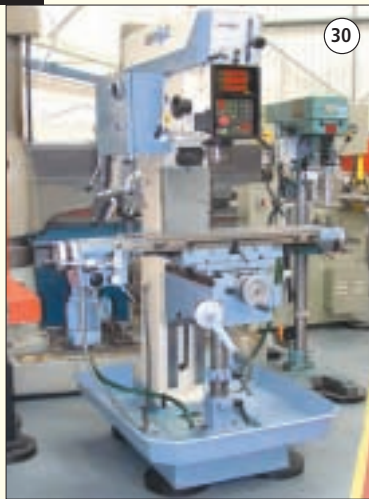
SERRMAC: Type TCS-VRTC DA Vertical Mill. Table Working Area 31" x 10". Throat 12". Variable Speed. Integral Readout. £2,750