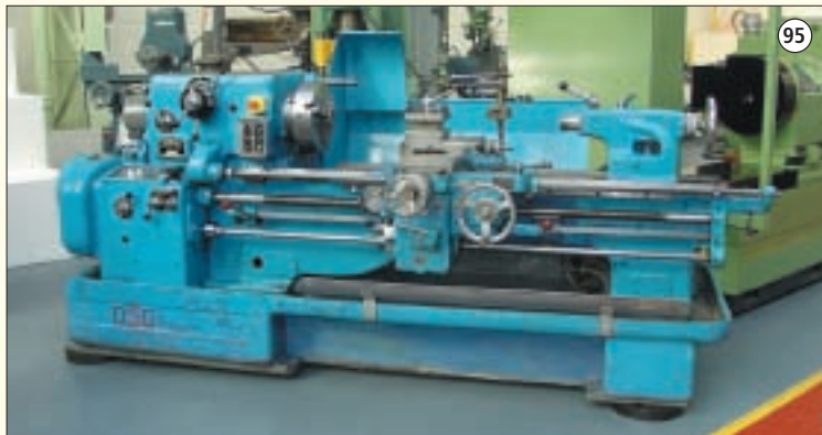
DEAN SMITH & GRACE Type 17T: Centre Lathe. 18" Swing Over Bed. 48" Between Centres. 2 1/4" Spindle Bore.