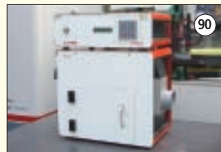
LOCTITE BONDOMATIC UV-1250: Electric Oven. £1,500