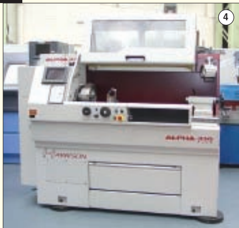
HARRISON ALPHA 330 PLUS: CNC/Manual Lathe. 40mm Bar Capacity. 330mm Swing Over Bed. 1000mm B/C. With GE Fanuc Alpha Control. Year 1997. £10,950