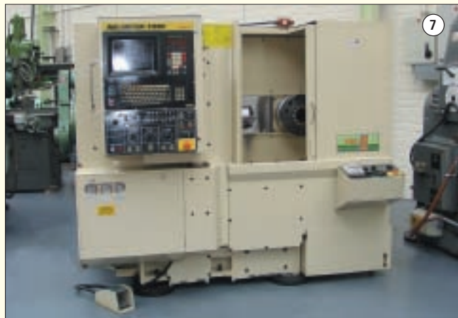
NAKAMURA-TOME TMC 2: Turning Centre. Year 1982. Fanuc 3T CNC Control. 6 1/2" Dia Power chuck. 12 Station Turret. Ex College.