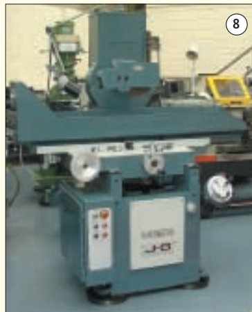
JONES & SHIPMAN TYPE 1430: Toolroom Surface Grinder. Long Column. Capacity 610mm x 300mm. Year 1985. Super Condition