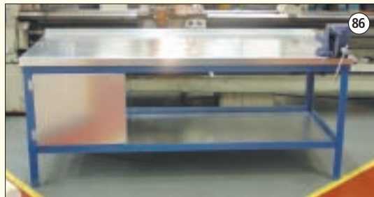
NEW: 45mm Timber & Steel Work Bench. With Galvanised Top. 2000mm x 750mm x 840mm High. (NEW) UNBREAKABLE: 6" Bench Vice £19,950