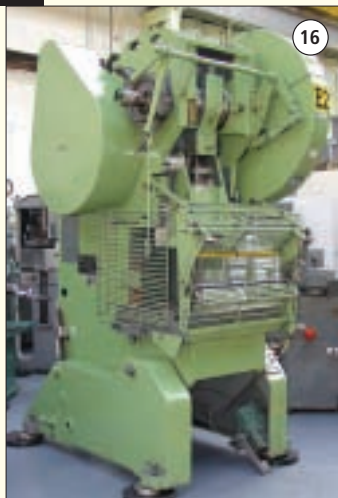
RHODES RF75: Power Press. 75 Ton Capacity. 1" to 4" Adjustable Stroke. Platen Size 32"x 24". Fully Guarded. £4,950