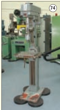
POLLARD: Pedestal Drill. No.1 Morse Taper. Table 12" x 10" Speeds 330-1870 rpm.