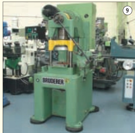
BRUDERER MODEL BSTA30: 30 Ton High Speed Power Press. Feed 20-100mm. Stroke Height 16-40mm. Strokes 100-600 spm. Platen Size 330mm x 280mm. With Coil Feed Unit.