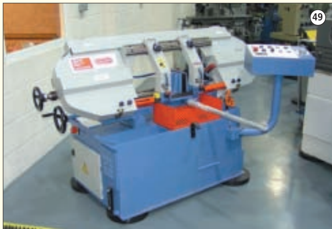
(NEW) UMS Type Westcut 280 Horizontal Bandsaw: 280mm Capacity. Gear Box Speed Control. Super Quality.