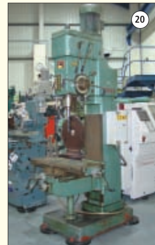
ARBEGA: Pedestal Drill. 900mm x 350mm Table. 400mm Throat. 5 M/T (3"). Power Feed. Tapping. £3,250