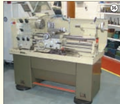
HARRISON: M300 Gap Bed Centre Lathe. 13" Swing over bed. 25" Between Centres. Ex. MOD Very Good Condition. £2,950