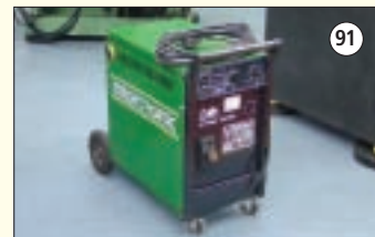
MIGATRONIC: Automig 180 MXE. Mig Set. Single Phase. £275