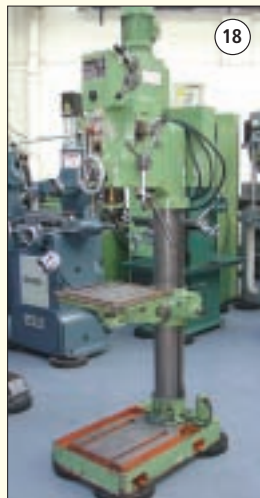
ERLO Type TCA 25: Pedestal Drill. 3 Morse Taper (1"). Speeds 96 to 1510 rpm. Power Feed. £1,400