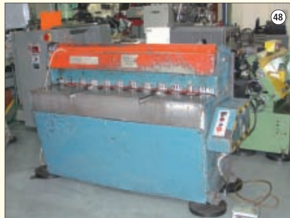
EDWARDS TRUECUT 2.5/1250DD: Power Guillotine. Capacity 1255mm x 2.5mm, with 2 Metre Squaring Arm.