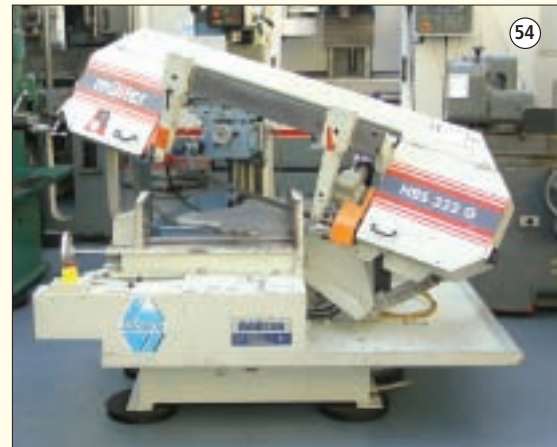
MULLER Type HBS 322G: Horizontal Bandsaw. Cap. 322mm Round. Complete With Mitring.