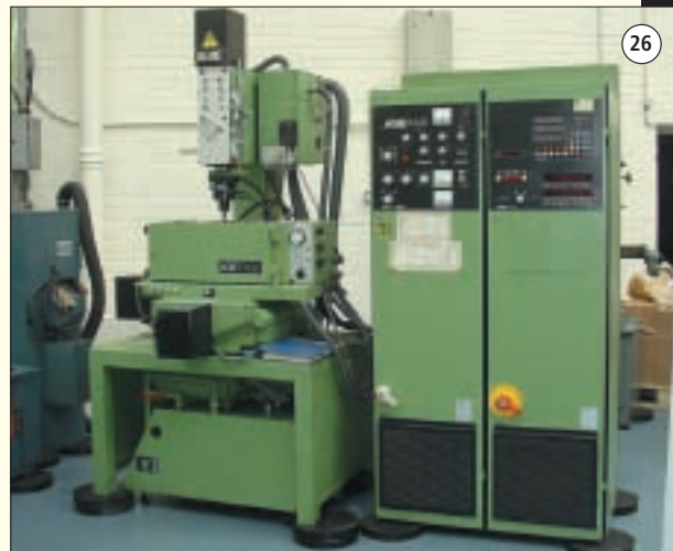
MECRODE Type NL201CNC: Spark Eroder with Orbicut CNC. Table 500mm x 260mm. Tank 550 x 390mm. Hours worked 6197 Amps 9+p. 11 kva. £3,950