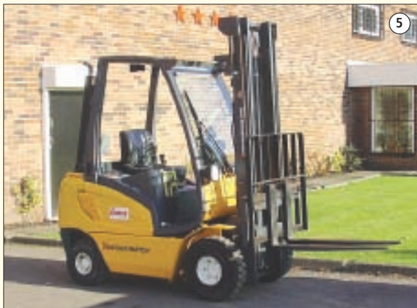
JUNGHEINRICH DFG 20AS: Diesel 2 Ton Forklift Truck. With Side Shift. Hours 229. New 1998. Max height 3390mm. Lights, Wipers. Super condition.