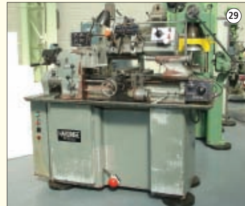
COLCHESTER Chipmaster: Centre Lathe. 10" Swing Over Bed. 20" Between Centres. 1½" Spindle Bore. £950