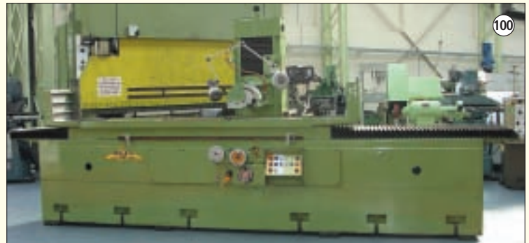
ELB Type SWO 17.5: Toolroom Surface Grinder. 1600mm x 400mm Capacity. Complete with Coolant. Low Volt Light and D.R.O. Super Condition. £14,950