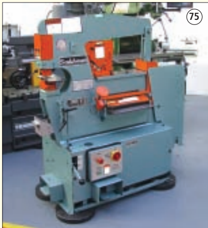
SCOTCHMAN Type 4014: Hydraulic Ironworker. Capacity 40 Ton. Punch 1" (25mm) Through 1/2" (13mm). Angle Shear 3" x 3" x 1/8".