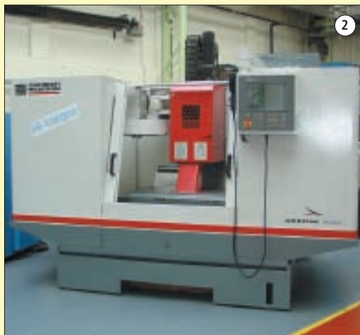
CINCINNATI MILACRON: Arrow 1000 Hi-Torque VMC. Year 1998. Siemens Acramatic 2100 Touch Screen Control. 21 Position Tool Changer. £15,250