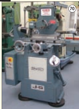
JONES & SHIPMAN Type 540: 'Manual' Toolroom Surface Grinder. 18" x 6" Capacity.