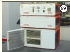
LOCTITE BONDOMATIC UV 1250: Electric Oven. £1,250