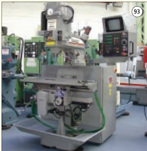
BRIDGEPORT INTERACT Series 1: 3 Axis CNC Miller. Table Size 320mm x 840mm. Heidenhain TNC 145 Control.