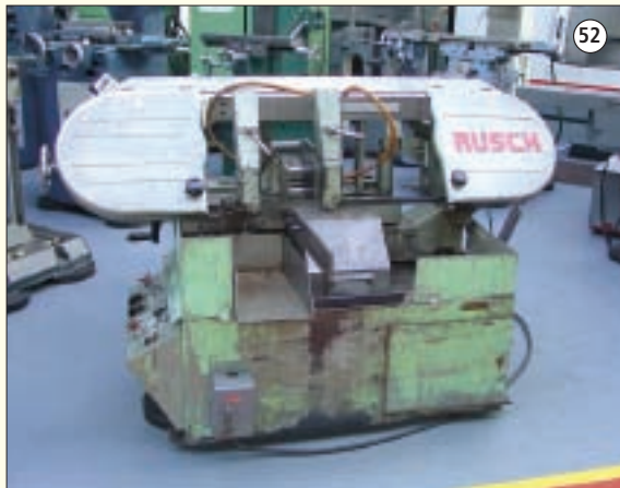
RUSCH: Automatic Horizontal Bandsaw. 10" Capacity.