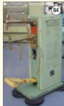
CEBORA 2684: Spot Welder. Capacity 15 Kva. £750