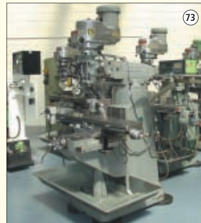
BRIDGEPORT BR2J2: Turret Mill. 42" x 9" Table. R8 Spindle Taper. Variable Speed Head. 2 Axis D.R.O.