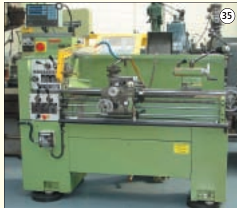
EMCO: MaxiMat V13 Centre Lathe. 13" Swing Over Bed. 36" Between Centres. With 2 Axis DRO. £1,950