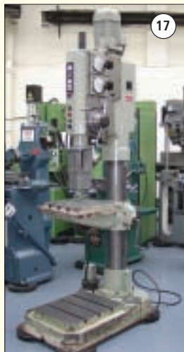
AJAX Type AJ40: Pedestal Drill. Spindle 4 Morse (2"). Power Feed. Speeds 59 to 1000 rpm. £1,650