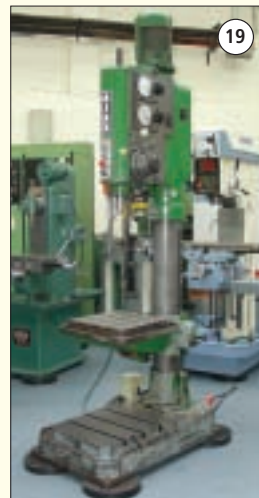
AJAX: Single Spindle Pedestal Drill. 4 Morse Taper (2"). Power Feed Table 16" x 16". £1,650