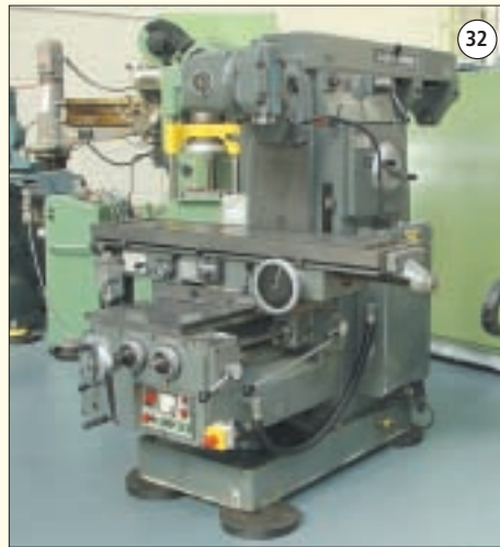
AJAX CLEVELAND 2UM: Universal Mill. Table 1400mm x 340mm. Long Axis 1067mm. Cross Axis 330mm. 50 ISO Spindle. With 40 ISO Double Swivel Head. £8,750