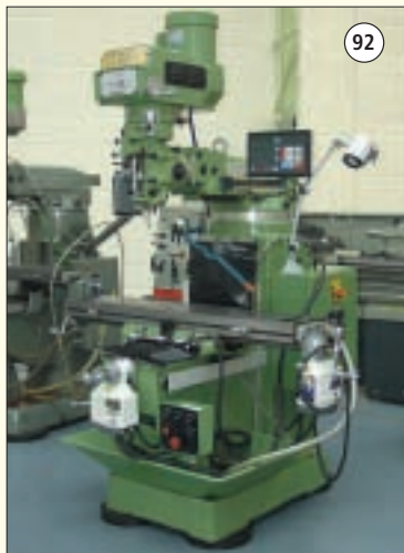
EUROPA: Type 1500VS. Turret Mill. Year 2003. Variable Speed Head. R8 Spindle. Table 49" x 9". 3 Axis D.R.O. Super Cond. Ex. University £4,250