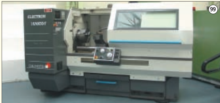
COLCHESTER MASCOT ELECTRONIC: Gap Bed Centre Lathe. Fanuc 20T Control. 18" Swing over Bed. 26" Swing in Gap. 40" Between Centres. 3" Spindle Bore. Speeds upto 2000rpm. Year 1996. £14,950