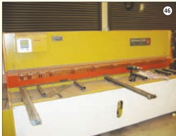
EDWARDS PEARSON: Hydraulic Power Guillotine. Capacity 3000mm x 6.5mm. Complete With Power Back Gauge. Ex. MOD.