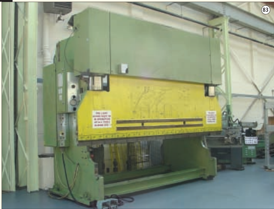
LVD Type PP220/40: Downstroke Hydraulic Press Brake. Maximum Capacity 220 ton x 4000mm. Year 1979. With Light Guards & Tooling.