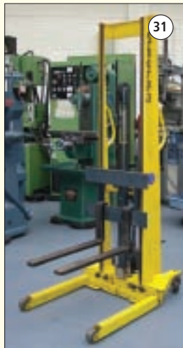
SHERPA 302: Manual ForkLift. S.W.L. 800lbs. 24" Forks. 48" Max Height. £300