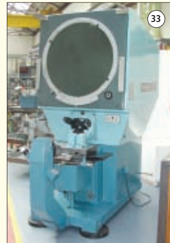
SIGMA: 30" Shadowgraph. 3 Lenses 50+ 25+ & 10+. Complete with 2 Axis Digital Readout £3,250