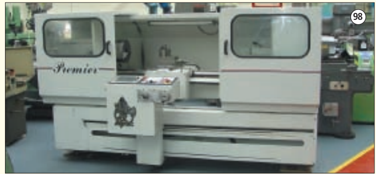
AJAX Premier 225: CNC Lathe with Fagor 800T Control. 225mm Swing Over Bed. 1650mm Between Centres. 3 Jaw Chuck & Steady. Year 1997. £7,950