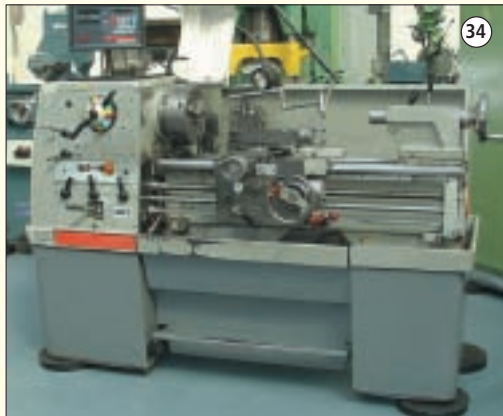
COLCHESTER TRIUMPH 2000: Gap Bed. 15" Swing Over Bed. 30" B/C. 2 1/2" Spindle. Newall DP7 DRO. Q.C.T.P. £3,750